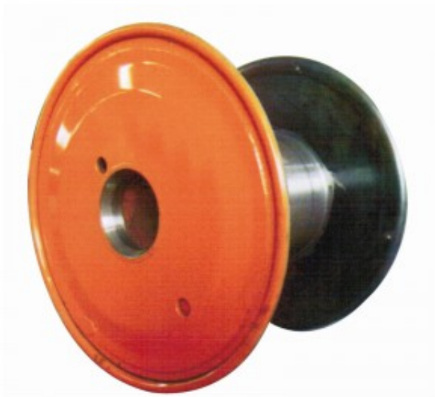
2.1 Double Layer High Speed Bobbin